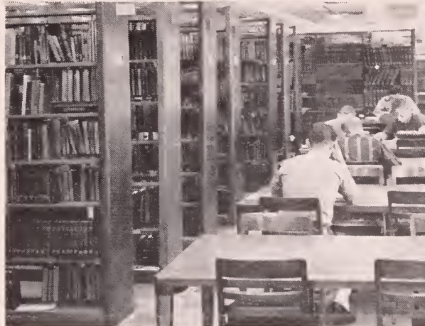
THIS PICTURE of students studying in a corner of the Humanities Area illustrates the convenience of proximity to books and good lighting which is observed throughout Russell Library. The library is fully airconditioned for student comfort.