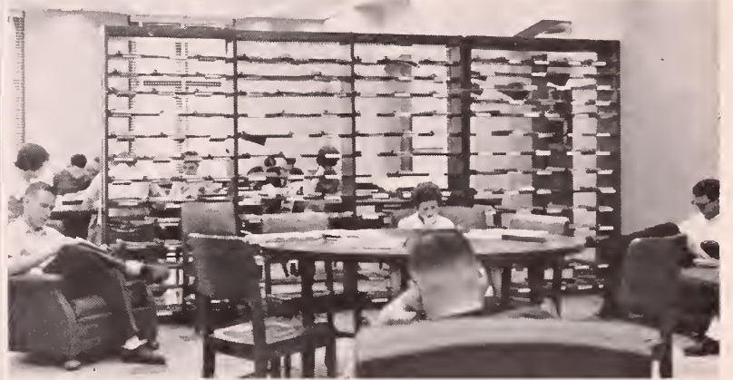
A GROUP of students make use of the Browsing Area, where current periodicals are available. The Reserve Reading Room is seen in the rear.